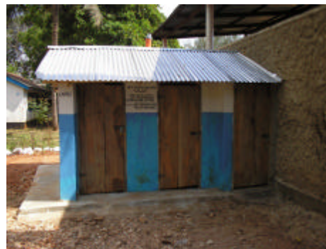
Latrines in Kenya