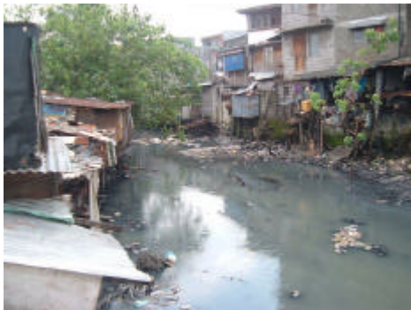
A slum without any supplies

The operator pays monthly a certain amount of money to the Dutch mother company. Another part of the profit will be used for reinvestment on behalf of the extension of the programme. The rest of the money is for the local operator’s own disposal.